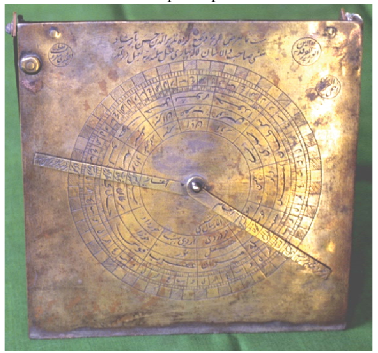
Fig. 4: Shabnumā-wa-Rūznumā , Observe showing the Shabnumā Khuda Bakhsh Oriental Public Library, Patna.

The obverse side of the plate is engraved as the Shabnumā or the night indicator (Fig. 4). There are eight concentric circles forming seven annuli. At the centre are pivoted two copper strips, measuring 95 and 90 mm respectively. These function as the indices. On these are engraved the arguments of the annuli, i.e. labels explaining the divisions marked on the seven annuli. For the sake of reference, we divide the circles into 360^{\circ} from the topmost point.