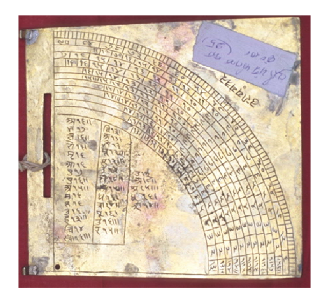
Fig. 2: Dhruvabhrama-yantra , Reverse showing the Horary Quadrant, Jai Singh's Observatory, Jaipur

About twenty specimens of the Dhruvabhrama-yantra are extant in different collections in India, Europe and the US. In 2010, a nice specimen came for auction at the Sotheby's of London (Sotheby's, lot 125, pp. 90-91). In these specimens, there is much variation, not only in the outer form of the plate and the design of the four-armed index, but also in the configuration of the concentric scales. Although Padmanābha prescribes that the reverse side should be prepared as a sine quadrant (Fig. 3), there are also specimens which contain a horary quadrant instead of the sine quadrant (Fig. 2).