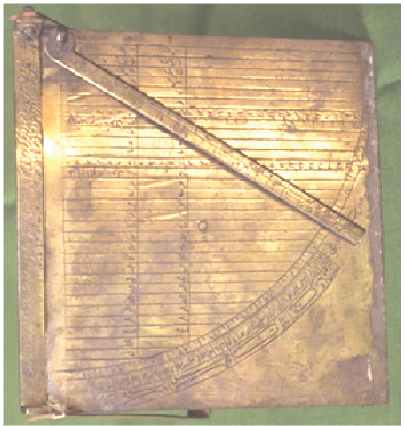
Fig. 5: Shabnumā-wa-Rūznumā , Reverse showing the Rūznumā Khuda Bakhsh Oriental Public Library, Patna

ma'kūs (umbra versa in [seven] feet), the lower one zill aṣābi<sup>c</sup> ma<sup>c</sup>kūs (umbra versa in [twelve] digits). On these horizontal lines the perpendiculars are numbered in Abjad (Arabic alphanumerical) letters, on the upper line from 1 to 30 and on the lower line from 1 to 28 (in both cases starting from the vertical radius). Horizontal parallels are not drawn, but they are marked on two vertical scales (i.e. nos. 7 and 12, as counted from the vertical radius). On these vertical scales, the horizontal parallels are numbered in Persian numerals. The seventh horizontal parallel is labelled as zill aqdām mustawī (umbra recta in [seven] feet) and the twelfth parallel zill aṣābi<sup>c</sup> mustawī (umbra recta in [twelve] digits). Thus the sine quadrant incorporates the shadow squares of 7 and 12 units which are usually engraved on the back of the astrolabe.<sup>1</sup>