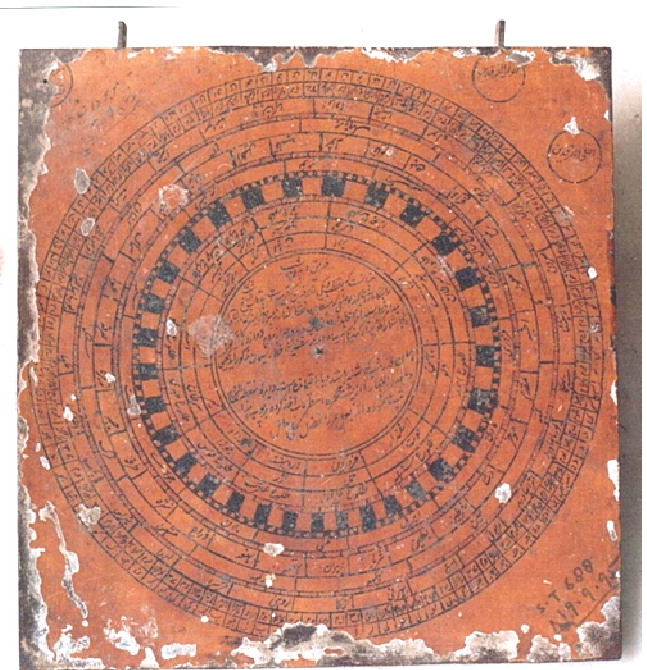
Fig. 6: Shabnumā-wa-Rūznumā , Observe showing the Shabnumā Raza Library, Rampur.

Arabic names of the zodiac signs with a prefix tul\bar{u}^c (rising) meaning signs in ascendance.