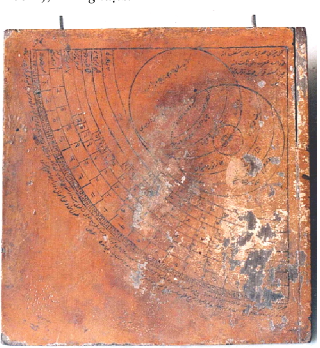
Fig. 7: Shabnumā-wa-Rūznumā , Reverse showing a Horary Quadrant as the Rūznamā. Raza Library, Rampur.

Each of these scales is used for one or two months. Depending on the length of the day in the corresponding solar month, these scales are divided into so many number of ghat\bar{\imath}s as there are in half a day of that month. Thus when the sun is in Cancer, the day is the longest. It has the duration of 34 \ ghat\bar{\imath}s (= 13 hours 36 minutes). The scale for this month is divided into 17 \ ghat\bar{\imath}s , which is the length of half a day. When the sun is in Capricorn, the days are the shortest: 24 \ ghat\bar{\imath}s (= 9 hours 36 minutes). Accordingly the scale is divided into 12 \ ghat\bar{\imath}s .