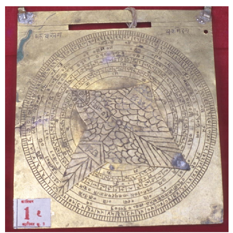
Fig. 1: Dhruvabhrama-yantra , Obverse showing the Dhruvabhrama Jai Singh's Observatory, Jaipur

signs, their sub-divisions, and also the lunar mansions (nakṣatras) pertaining to these two sets.